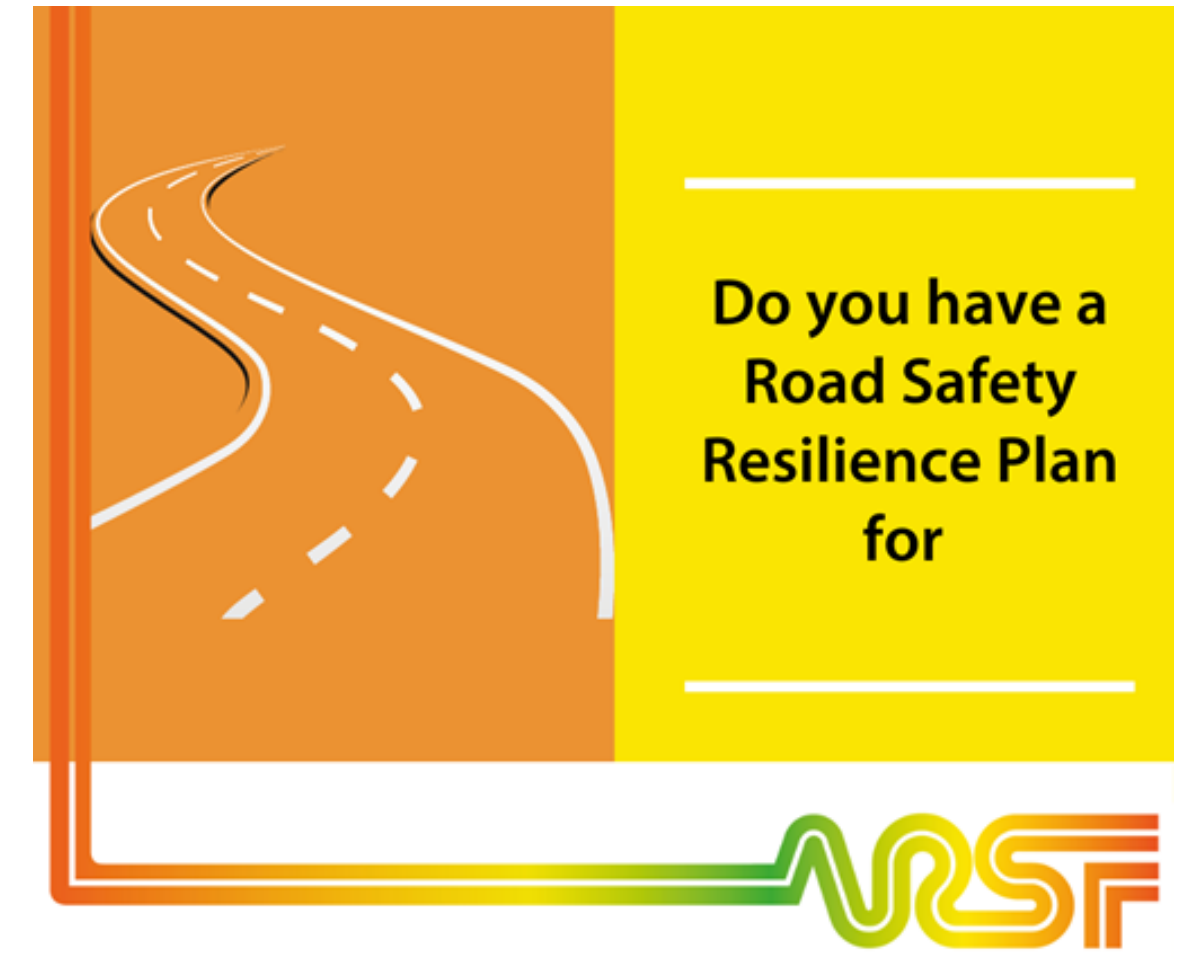
Road Safety Resilience Social Posts

CLICK HERE to download your campaign assets