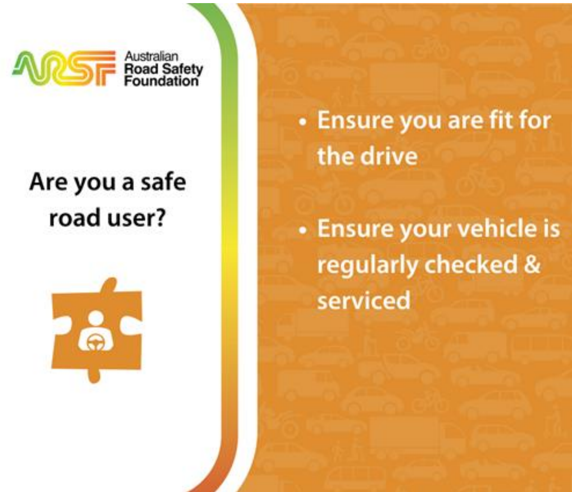
Road User Social Posts