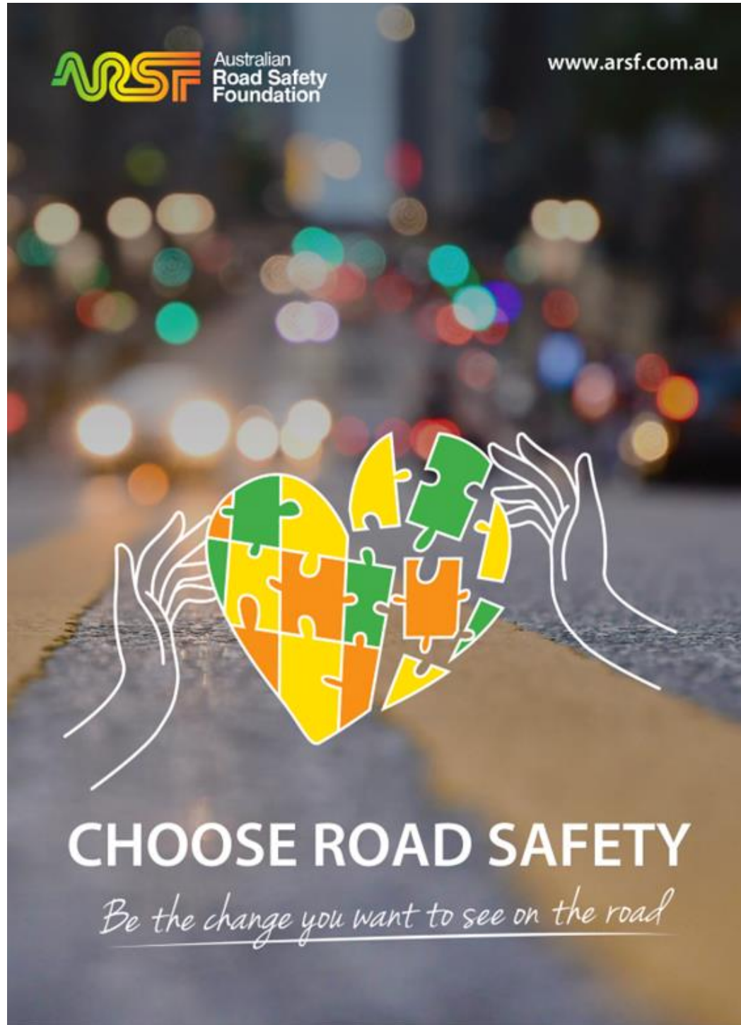
A6 Promotional Insert